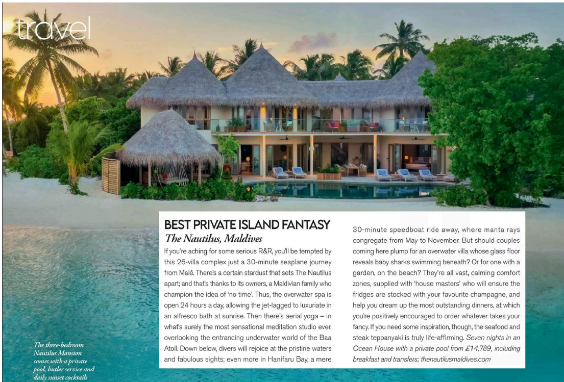
The three-bedroom Nautilus Mansion comes with a private pool, butler service and daily sunset cocktails