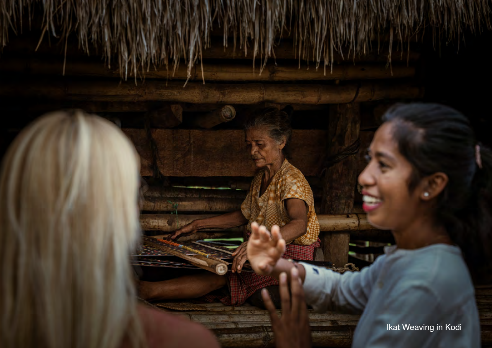
Ikat Weaving in Kodi