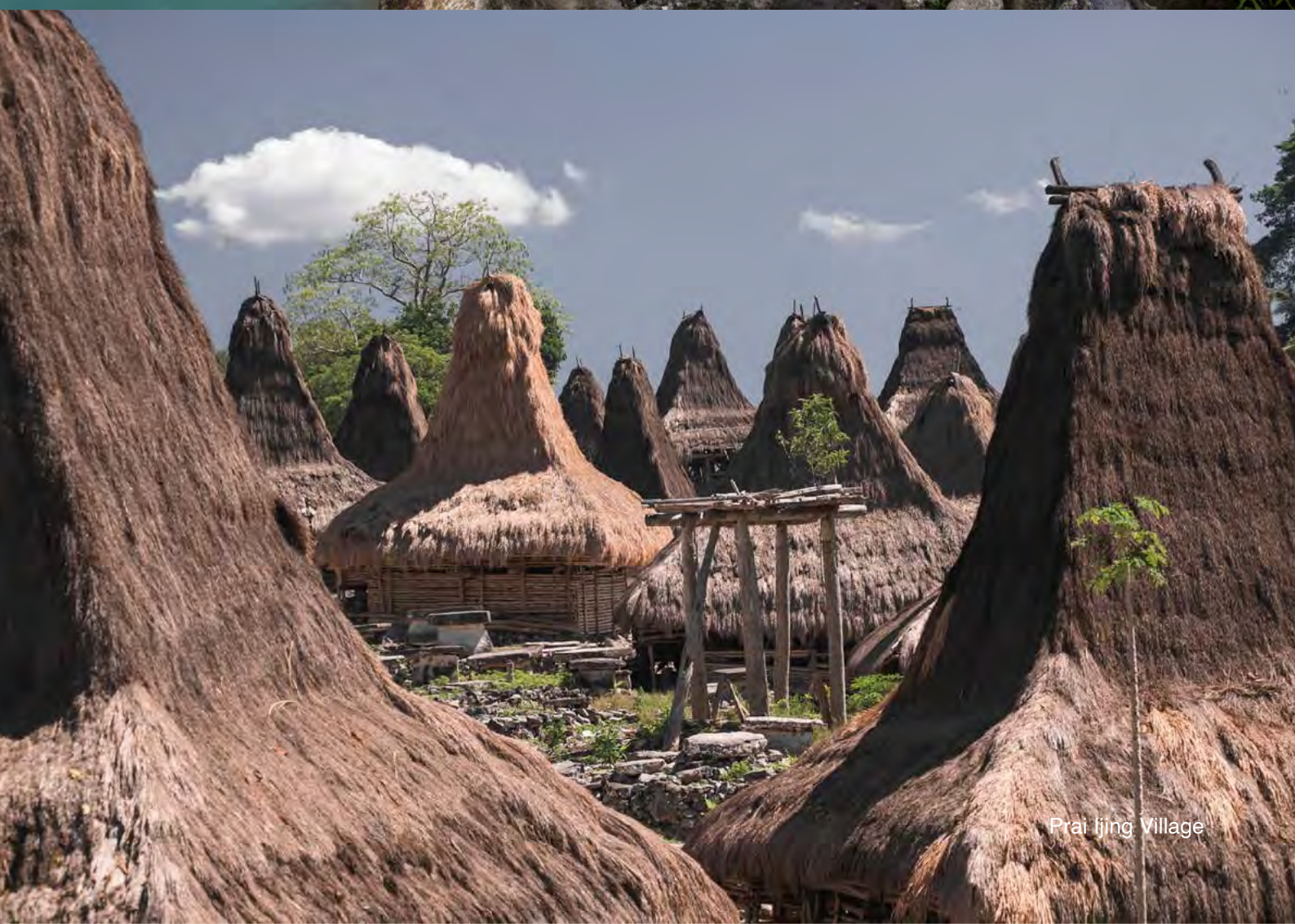
Prai Ijing Village